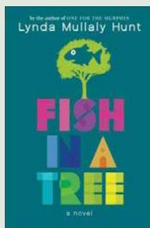
Fish in a Tree SP Lynda Mullaly Hunt (3.7, MG, 550L)