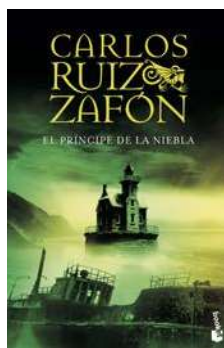
El príncipe de la niebla SP Carlos Ruiz Zafón (4.9, MG)