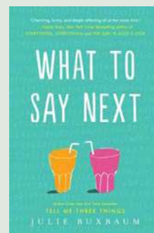
What to Say Next Julie Buxbaum (5.2, UG, 760L)