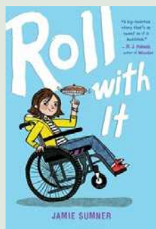
Roll With It Jamie Sumner (4.6, MG, 740L)